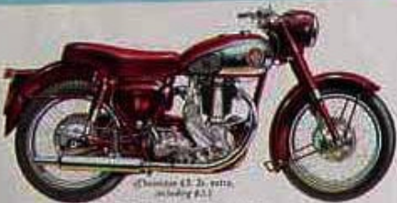
(Johnson £2. 2s. extra, including £1.)

For the man who wants a lightweight model that combines economy, easy handling, simplicity of maintenance and a satisfying performance, the answer is the B.S.A. Chief (see model). It is attractively finished in two tones of green (shown).