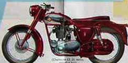
(Johnson £2. 2s. extra, including £1.)

A smart, versatile touring motor capable of high speed touring with several leaders for two people. With duplex cradle frame, swinging arm suspension, full width hubs and superb engine performance, this B.S.A. 500 Twin makes a wide appeal to knowledgeable motor cyclists. It's a smart looking machine, too, in maroon (as illustrated) and chromium, including chromium covers on the petrol tank.