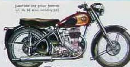
(Dual seat and pillion footrests £2. 16s. 3d. extra, including £1.)

Exhilarating acceleration, extreme flexibility, perfect road holding and track stability also—these superb features and striking appearance make the Golden Flash popular as either a power bike or a touring machine. Features which contribute to its remarkable performance include duplex cradle frame, swinging arm rear suspension and full width aluminium hubs with powerful brakes. The rear wheel is quickly detachable while a rear chain cover giving complete enclosure can be fitted to order. Fuller rear suspension model illustrated below (right).