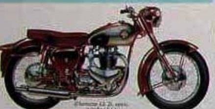
(Johnson £2. 2s. extra, including £1.)