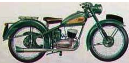
BSA 125 cc. D1-BANTAM £84 (p.t. £18. 6s. 10d. total £104. 6s. 10d.)

Price with Battery lighting £88 (p.t. £19. 4s. total £109. 4s.) A thoroughly reliable lightweight of proven performance, of 45hp to 1150 and the ideal motor cycle for the beginner. No other machine in the history of motor cycling has achieved such world-wide popularity. In price, economy, ease of handling and maintenance the Bantam has no equal. Finish a gleam green (as illustrated) or brown or black.