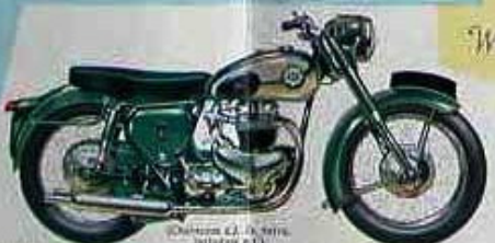
(Johnson £2. 2s. extra, including £1.)