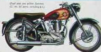
(Dual seat and pillion footrests £2. 16s. 3d. extra, including £1.)

For extra comfort this sturdy machine has a frame incorporating swinging arm rear suspension, a four-speed gearbox to take full advantage of its engine power, and the finish is smart-looking maroon with cream and chromium accents. In order on the petrol tank, or black in place of maroon, if preferred.