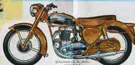
(Johnson £2. 10s. extra, including £1.)

A powerful single-cylinder model which has led to many more and on no other occasion proved the truth of the saying—"You can have it 12 year B.S.A." The high power-weight ratio of the B33 with its 700 O.H.V. engine gives this machine an exhilarating performance. It has all the outstanding features of the 500 O.H.V., including chromium plated petrol tank, rubber-mounted swing-halt King, shock-proof headlight, fully plated guards, dual seat and pillion footrests.