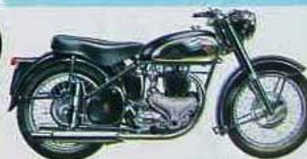
BSA 550 cc. O.H.V. TWIN AIR GOLDEN FLASH plunger spring frame

An exceptionally light standard road machine, as its name implies, the Road Rocket has a surprisingly long and light engine, light alloy cylinder head with high compression pistons, Amal T.T. racing carburettor, sports carburettor, etc. It is undoubtedly the world's greatest motor cycle, and to get the best of this powerful 550 engine when the twist-grip is turned in to show the thrill of road supremacy at 100 mph.