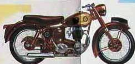
BSA 250 cc. O.H.V. C12 £129. 10s. (p.t. £31. 1s. 6d. total £160. 11s. 6d.)

Price with Battery lighting £88 (p.t. £19. 4s. total £109. 2s. 5d.) The Bantam's big brother has a frame incorporating swinging arm rear suspension, an improved design of silencer, and is finished in pearl grey (as illustrated), maroon or black. Over 130,000 Bantam D3 models are giving wonderful service in their native air over the world, and numerous long-distance tours have been undertaken by Bantam riders.