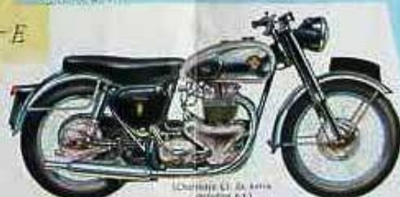
(Johnson £2. 2s. extra, including £1.)

Ease of handling, speed transmission and almost top-speed pulling make the Shooting Star a delightful machine to ride in traffic, while careful acceleration in all gears, a low-inertia and superb engine performance, full width hubs and superb engine performance, this B.S.A. 500 Twin makes a wide appeal to knowledgeable motor cyclists. It's a smart looking machine, too, in maroon (as illustrated) and chromium, including chromium covers on the petrol tank.