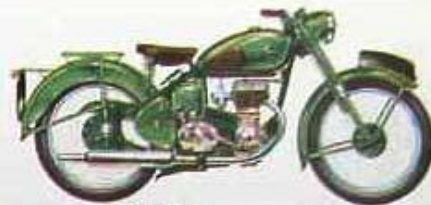
BSA 350 cc. S.V. CHIEF £106 (p.t. £25. 10s. 10d. total £131. 10s. 10d.)

For the man who wants a lightweight model that combines economy, easy handling, simplicity of maintenance and a satisfying performance, the answer is the B.S.A. Chief (see model). It is attractively finished in two tones of green (shown).