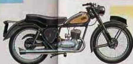
BSA 350 cc. D3 BANTAM MAJOR £84 (p.t. £20. 3s. 3d. total £104. 3s. 3d.)

Described by The Motor Cycle as "most substantial, comfortable and fast, handy in traffic, excellent steering and braking" the B31 is one of the most popular machines on the road. Many outstanding features combine to make this machine first class in performance and value—duplex cradle frame, swinging arm rear suspension, full width aluminium alloy hubs and powerful brakes, quickly detachable rear wheel—one has a few